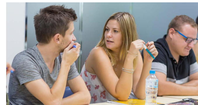
*(including 3hrs optional workshops & 2hrs optional activities)

EAP is the best choice for students who need to use English in an academic course setting or enter a higher education program at university or TAFE level. EAP students can also join the afternoon Workshops.